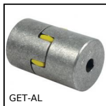
GET-AL Jaw coupling, economy range, Aluminium