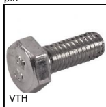
VTH Hexagonal headed bolts, Steel class 8.8