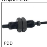
PDD Actuating plunger, Non-rotating detector