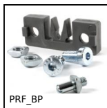
Doorstop for aluminium profile, Swing door stop