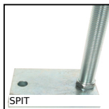
Floor mounting levelling plate, With anchoring point