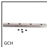
GCH Linear ball slide Eco Range, economy range