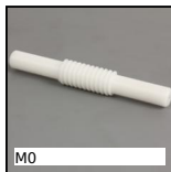
Worm and wheel set, Machined plastic (delrin)