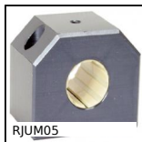
Drylin R® linear bearing housing, Closed - Slim