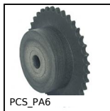
Plastic sprocket, 12.7mm (DIN 08B-1)