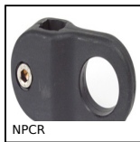
Adjustable cell support, Adjustable