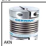
AKN Bellows coupling Gerwah®, from 22 to