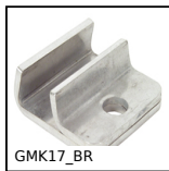
GMK17_BR Clamp for guiding profile, Rounded only - single