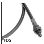
Flexible drive shaft, Masterflex® Steel, with PVC casing