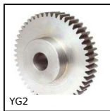
HEAVY DUTY spur gear, Steel 35NCD6