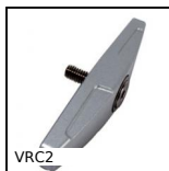
VRC2 Retaining clamp, dual sided, Dual sided