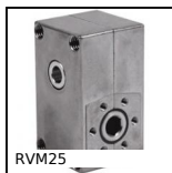
Manually operated gearbox, Bevel