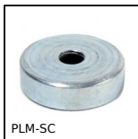
PLM-SC Magnetic stud with central countersunk hole, With milled bore