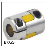
BKGS Backlash free coupling Gerwah®