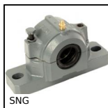
SNG Stainless/Polymer pillow block bearing, Cast iron - Split pillow