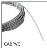
CABPVC PVC covered galvanised steel cable, Galvanised steel with