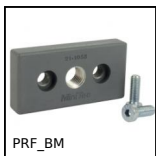
PRF_BM Base support plate for aluminium profile, Central base fixation