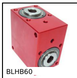
BLHB60 Right angled gearbox, bored shafts, up to 70 Nm