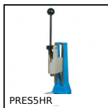
PRESSHR Manual workbench press, Force up to 500kg