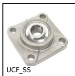
UCF_SS Stainless steel flanged bearing, Stainless steel