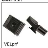
VELprf Clip-on base for hook- and-loop strip, Polyamide