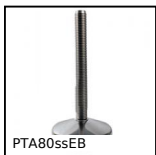
PTA80ssEB Articulated foot with sheet metal base Ø80, Articulated foot