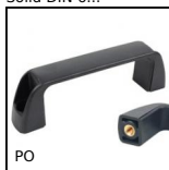
PO Pull handle - Multi-sector, Tapped