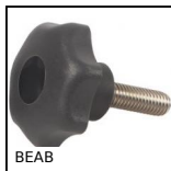
BEAB Knob star grip antibacterial, Star, anti-bacterial