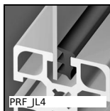
PRF_JL4 Lip seal for panel, Door seal - Ø 4mm