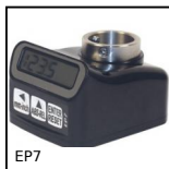
EP7 Electronic digital position indicator, 5 numbers