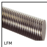
LFM Steel leadscrew, Medium carbon steel