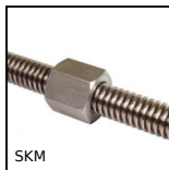
SKM Hexagonal steel nut, Steel - 1 thread