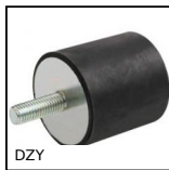
DZY Cylindrical stop, Steel