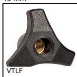
VTLF 3 lobed handle, Polyamide - Brass