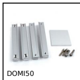
DOMI50 Connecting kits, XY linking kit