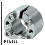
RT61ss Self-centering locking Assembly, Medium/low torque