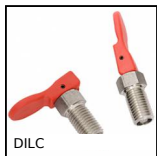
DILC Indexing plunger with cam, with cam