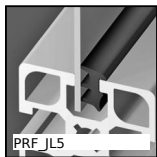
PRF JL5 Lip seal for panel, Door seal - Ø 5mm