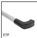
ETP Modular handle for aluminium profile, Modular handle