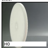
H0 Crossed helical gear crossed axis at 90°