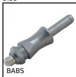
BABS 630 Stainless steel compact ball pin, Hardened stainless steel