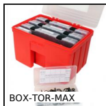
BOX-TOR-MAX Box set of Nitrile O- rings in nitrile, 2.90 x 1.78mm to 82.14 x 3.53