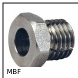
MBF Threaded blocking clamp, Threaded locking clamp