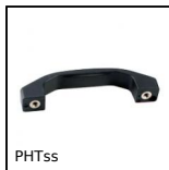
PHTss Pull handle, Up to 250 °C