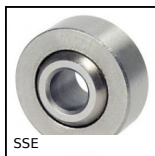
SSE Stainless steel spherical bearing,