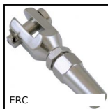
ERC Quick fitting cable terminal, Fork