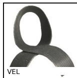
VEL Self-gripping cable strip, electric and pneumatic cables