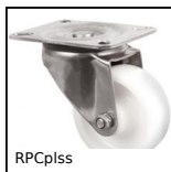
RPCplss Swivel castor with plate, Stainless steel - Polyamide