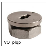
VQTplqp Quarter-turn clamp lock - Clamping plate, Wall mounting