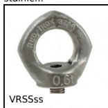
VRSSss Male swivelling lifting rings stainless steel, Male swivelling - stainless steel...