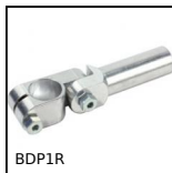
BDP1R Adjustable support arm, Single clamp