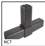
NCT Square tube connector, Fixed angle