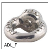
ADL_F Female eye bolt conforms to DIN582, Stainless steel