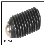
BPM Slotted spring plunger with ball tip, Steel