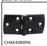
CHAE4080PA Symetrical decorative screwed hinge, Polyamide