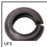
UFX Spare tyre UNEFLEX® coupling, range