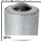
BPH Ball transfer unit plain fit, High