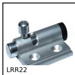
LRR22 Small dimension latch with locking system, Aluminium