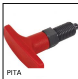
PITA Locking bolt, with T handle