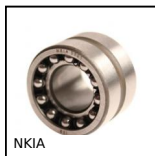
NKIA Combined bearing with inner ring, Axial load in one direction