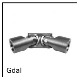
Gdal Double universal joint eco series, Low duty