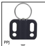
PPJ Indexing plunger with flange, With horizontal mounting flange and pu...