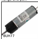
BUH77 Motor-gearbox 12V and 24V DC, from 0.1