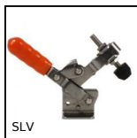
SLV Vertical toggle clamp, Vertical Lever Clamp -