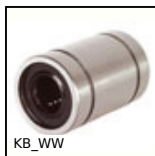
KB_WW Linear bearing, Economy range