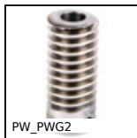
PW_PWG2 Worm - precision range, Steel