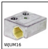
WJUM16 Drylin® W modular guidance, Slide