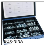
BOX-NINA Self locking nut - DIN985, Box set of steel nuts