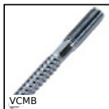
VCMB Dual-thread screw wood/metal, Stainless steel