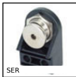
SER Hinged door accessories, Magnetic doorstop