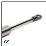
GSI Gas spring, Stainless steel