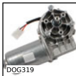
DOG319 DC Motor and gearbox combination, from 4 to 9 Nm