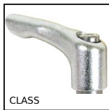
CLASS Stainless steel indexing handle - female, Stainless steel