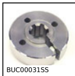
BUC00031SS Splined collar, Stainless steel