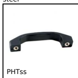
PHTss Pull handle, Up to 250 °C