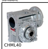
CHML40 Worm and wheel gear reducer, up to 57 Nm - Integrated torque limiter