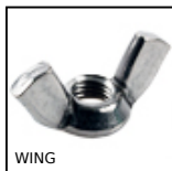
WING Manually tightened wing nut, Stainless steel DIN 314/315