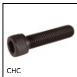
CHC Socket headed screw CHC - DIN 912, Steel class 12.19