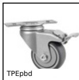
TPEpbd Wheel, Swivel with brake