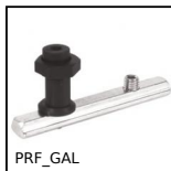
PRF_GAL Roller for aluminium profile, Fixing kit for roller eccentric