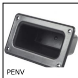
PENV Recessed handle, screw fixing