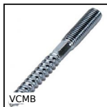
VCMB Dual-thread screw wood/metal, Stainless steel