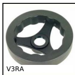
V3RA 3-spoked handwheel without handle, Polyamide