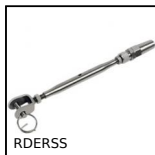
PRDERS Stainless steel manual rigging screw, Stainless steel - manual