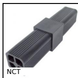
NCT Square tube connector, Fixed angle