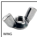
WING Manually tightened wing nut, Stainless steel DIN 314/315