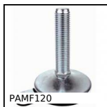
PAMF120 Articulated fixable foot, pressed bolt- down base Ø 120, Ø