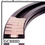
GCB880 Curved track for slat top chain, Ranges 880 and 881