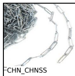
FCHN_CHNSS Straight long link chain, Galvanised steel