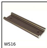
WS16 Dylin® W rail, Rail