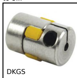
DKGS Backlash free coupling Gerwah®, from 0.5 to 3Nm