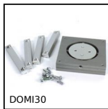
DOMI30 Accessories, Turntable