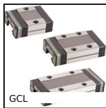
GCL Linear ball slide - Stainless steel balls, Chariot - from 516 N to 8...