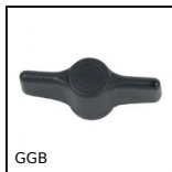
GGB Female wing knob, With blind thread