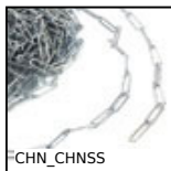
CHN_CHNSS Straight long link chain, Galvanised steel