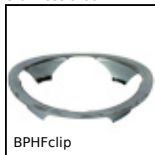
BPHclip Ball transfer unit, Insert clip - Installing from above