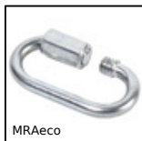
MRAeco Quick link, Steel