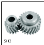
SH2 Parallel axis helical gear, Steel 20NCD2