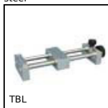
TBL Mini leadscrew table with metric thread, For manual position adjustment