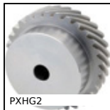
PXHG2 Crossed helical gear - precision range, 35NCD6 Pre-hardened steel