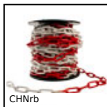
CHNrb Warning chain with red and white links, Steel