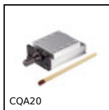
CQA20 Adjustment slide- system miniature, 20