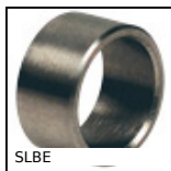
SLBE Index bolt, Spacer for SLB and SLBS index bolts