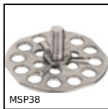
MSP38 Masterplate® glueable insert, Cylindrical Ø38 with threaded stud