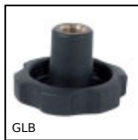
GLB Small 6 lobe threaded handle, Technopolymer - Stainless steel