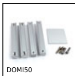
DOMI50 DOMILINE - Accessories, XY linking kit