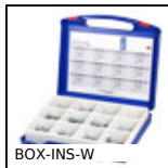
BOX-INS-W Self tapping insert, Boxed set - For wood