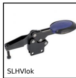
SLHVlok Horizontal toggle clamp, Horizontal toggle clamp / vertical foot