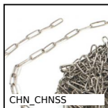
Straight long link stainless steel chain, Stainless steel