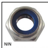
Self-locking nut, Steel