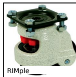
Locking castor, with mounting plate