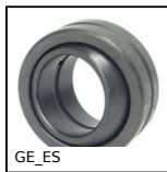
Spherical bushing, Steel / steel