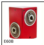
Right angle helical reducers, from 4.50 to 24 Nm