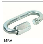
Quick link, Steel