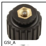
GSI_A Gas control screw for gas spring, Gas control screw