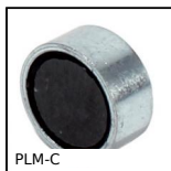
PLM-C Flat gripping magnet, Flat holding magnet