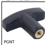
PGNT Thermoplastic T handle, With threaded insert