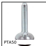
PTA50 Articulated levelling foot, pressed base