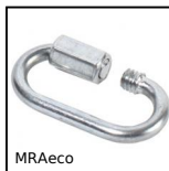
Low cost quick link, Steel