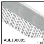
Antistatic brush, Standard