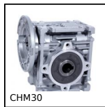
Worm and wheel gear reducer, up to 28 Nm