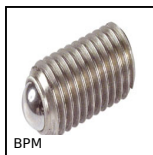
BPM Slotted spring plunger with ball tip, Stainless steel 303