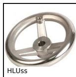
HLUs Spoked handwheel, Stainless steel 316