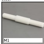
M1 Worm and wheel set, Machined plastic (delrin)