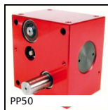
Worm and wheel gear reducer, from 6.50 to 12.80 Nm