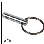
AFA Locking pin, with ring