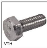
Hexagonal headed bolts, Steel class 8.8