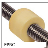
High helix leadscrew, Cylindrical nut - up to 40mm per rotation