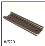
Drylin® W rail, Rail