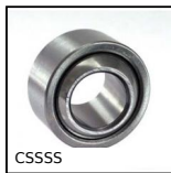
Stainless steel spherical bearing, Stainless steel / PTFE