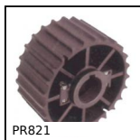
Idler sprocket for slat top chain, Ranges 821 and 805