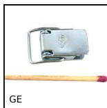
Toggle latches, Miniature