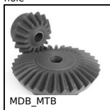
Moulded plastic bevel gear (nylon), 2:1