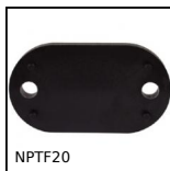
Spacer for tube carrier, Fixing accessory \varnothing 10 to \varnothing 14