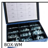
Box set of washer - DIN125, Box set of steel washers