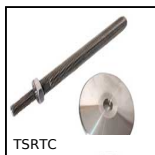
Stem support for caster, For swivel caster with central hole