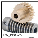
Wheel - precision range, Bronze