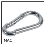
Carabiner DIN5299 steel, Steel