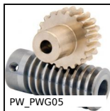
Wheel - precision range, Bronze