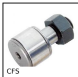
Miniature cam follower, Miniature