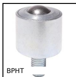
Ball transfer unit bolt fitting, Heavy