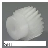
Parallel axis helical gear, Machined plastic (delrin)