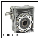
Worm and wheel gear reducer, up to 980 Nm