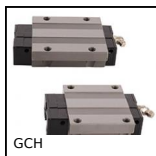
Linear ball slide - Stainless steel balls,