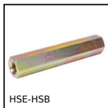
Hexagonal spacer, Steel