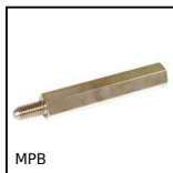
Hexagonal spacer, Brass