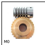
Worm and wheel set, Bronze