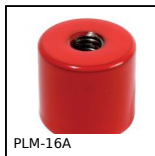
PLM-16A Magnetic stud with threaded hole, With threaded hole