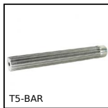
T5-BAR T type tooth bar stock, T5