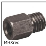
MHXred Reducing sleeve male/female, Hexagonal - steel