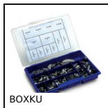
BOXKU Boxed set of half round (Woodruff) keys NFE22179, Boxed set of half ...