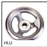
HLU Spoked handwheel without handle, Aluminium