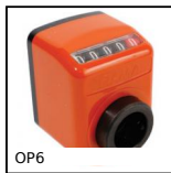
OP6 Mechanical digital position indicator, 5 numbers