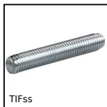
TIFss Threaded stud - DIN976A, Stainless steel