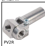
PV2R Adjustable suction- cup support, Increased grip