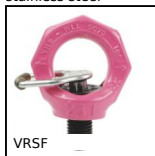
VRSF Male swivelling lifting ring, Male swivelling