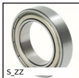
S_ZZ Deep groove ball bearing, Stainless steel