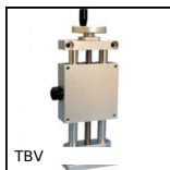
TBV Manual lifting tables, 20kg