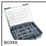
BOXKK Boxed set of DIN6885A keys, Boxed set - Steel or stainless steel