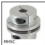
MHSC Single-disc flexible coupling, Single disk