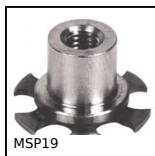
MSP19 Masterplate® glueable insert Ø19, Cylindrical with tapped insert