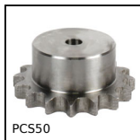
PCS50 Chain sprocket - steel, 12.7mm (DIN08B-1)