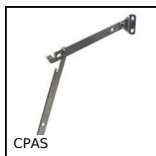
CPAS Stay with safety catch, Opens upward