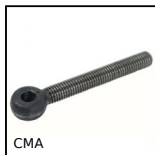
CMA Eye bolt, Steel