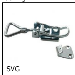
SVG Adjustable latch clamp with strike plate, Stroke from 118mm to 130,5mm