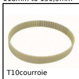
T10courroie T type timing belt, T10 Steel cored