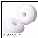
Machined plastic bevel gear , 1:1