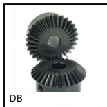
Steel bevel gear, 2:1