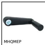
Arm with rotating handle, Square bore