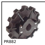
Idler sprocket for slat top chain, Range 882