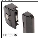
Lock for aluminium profile, Lock