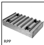
Connecting plate for RPP type timing belts, RPP8