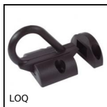
Manual lock, Manual latch