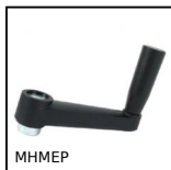
Arm with rotating handle, Prebored