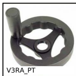
3-spoked handwheel with handle, Polyamide