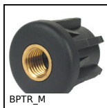
BPTR_M End cap with threaded insert for round tube,