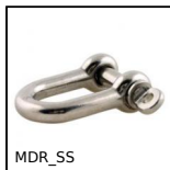
Stainless steel Dee shackle with eye bolt, Stainless steel