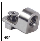
Right angled support clamp, Right angled support clamp