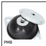
Anti-vibration machine mount, Oval base plate