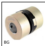
BG Oldham coupling, With set screw