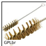
GPLbr Brush, brass