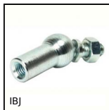
IBJ 180° ball and socket joints, Steel