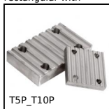
T5P_T10P Connecting plate for T type timing belts, T10