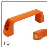
PO Pull handle - Multi-sector, Tapped recessed insert