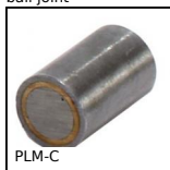
PLM-C Cylindrical holding magnets, Cylindrical holding magnet