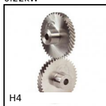
H4 Crossed helical gear crossed axis at 90°