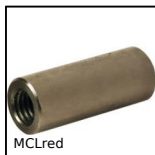
MCLred Reducing sleeve female/female, Cylindrical - steel