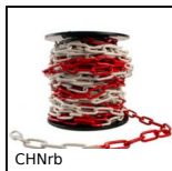
CHNrb Warning chain with red and white links, Steel