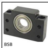
BSB Ball screw bearing unit, Support