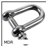
MDR Dee shackle with eye bolt, Steel