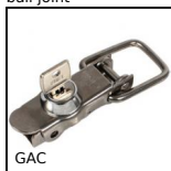
GAC Latch clamp with lock, Lockable