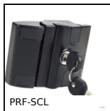
PRF-SCL Lock for aluminium profile, Lock for sliding doors