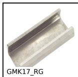
GMK17_RG Joint for guiding profile, Rounded