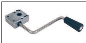
Used with a RVM14 gearbox