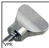
VPR Wing screw Hygienic Usit®, Stainless steel