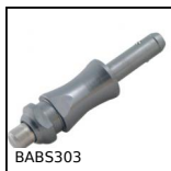
BABS303 303 Stainless steel compact ball pin,