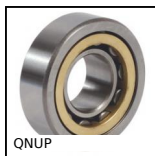
QNUP Single row cylindrical roller bearing, 1 fixed