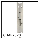
CHAR7520 Spring hinge, screwed