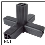
NCT Square tube connector, Fixed angle