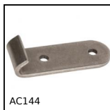
AC144 Strike for toggle latch, 22mm