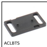
ACLBT5 Closing system for aluminium profile, Spacer for spherical ended stop