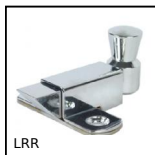
LRR Spring loaded latch, Spring loaded latch