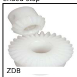
ZDB Machined plastic bevel gear , 2:1