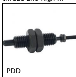
PDD Actuating plunger, Non-rotating detector