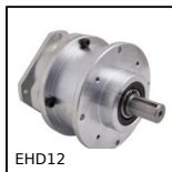
EHD12 Internal epicyclic servo reducers, from 60 to 140 Nm