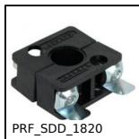
PRF_SDD_1820 Support for Ø18 or Ø20mm Prox detector, Ø18 and Ø20