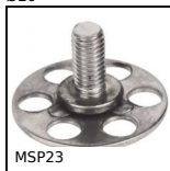
MSP23 Masterplate® glueable insert Ø23, Cylindrical Ø23 with threaded s...