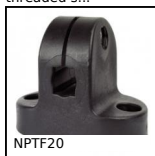
NPTF20 Fixed tube carrier, Fixed Ø10 to Ø14