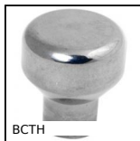
BCTH Mushroom headed button Hygienic Usit®, With female thread and high ...