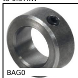
BAG0 Locking rings in steel, Steel