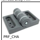
PRF_CHA Hinge for aluminium profile, Surface mounting hinge