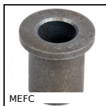
MEFC Flanged sintered ferrous bush, Self- lubricating FP20 ferrous alloy M...