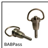
Hardened stainless steel ball pin with ring, With grip ring