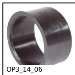
Reducing sleeve for OP indicators, Reduction socket