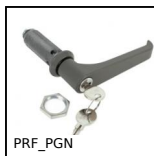
Door handle for aluminium profile, Handle with lock suitable