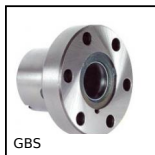
Nut for ballscrew, Flanged ballscrew nut