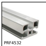
Standard aluminium profile, 45 x 32 mm