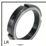
Precision locknut, Precision locknut