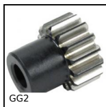
Ground spur gear, Heat treated steel