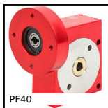
Worm and wheel gear reducer, up to 18 Nm