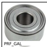
PRF_GAL Roller for aluminium profile, Flat roller