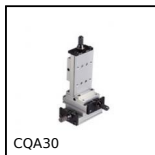
CQA30 Accessory for adjustment slide-system, 30