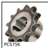
PCS75K Chain sprocket with hardened teeth, 19.05mm (DIN12B-1)