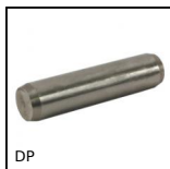
DP Dowel pin, Solid ISO 2338