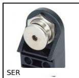
SER Magnetic doorstop for aluminium profile, Magnetic doorstop