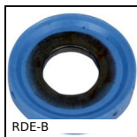
RDE-B Sealing washer Hygienic Usit®.