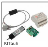
KITbuh 24V DC motorisation kit, Planetary gears