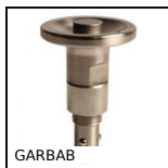
GARBAB Lock pin for clamping, Ball lock pin