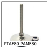
PTAf80-PAMF80 Articulated fixable foot with pressed base Ø80, Ø 80