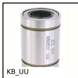
KB_UU Closed linear precision bearing, Precision - steel