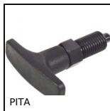
PITA Locking bolt, with T handle