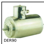
DER90 Stainless steel AC asynchronous motor 1.1 - 1.5kW, 1.1 to 1.5kW