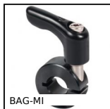
BAG-MI Split shaft collar with clamp lever, Steel