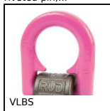
VLBS Folding lifting ring for welding, Folding - for welding