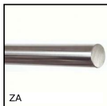
ZA Shaft for linear guides, Hardened ground steel