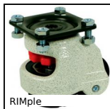
RIMple Locking castor, with mounting plate