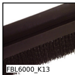
FBL6000_K13 Brush strip per meter PP fibres Ø0.2, Black striated polypropylene ...