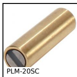
PLM-20SC Cylindrical magnet, Cylindrical magnet