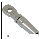
ERC Quick fitting cable terminal, Eye version