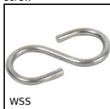
WSS Symmetrical S shaped hook, Steel