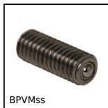
BPVMss Stainless steel miniature ball transfer unit, Miniature to screw