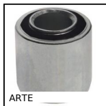
ARTE Flexible bush, For multi-directional loads