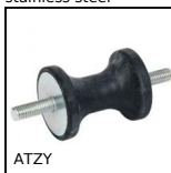
ATZY Diabolo shaped elasto mount, Steel