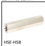
HSE-HSB Hexagonal spacer, Brass