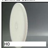
H0 Crossed helical gear crossed axis at 90°