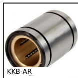
KKB-AR Linear bearing with inclined ball tracks, Standard loads / -20° +20°...