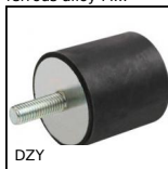
DZY Cylindrical stop, Steel