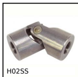
H02SS Needle roller universal joint - Stainless steel, Heavy duty DIN808-7...