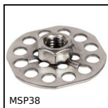
MSP38 Masterplate® glueable insert Ø38, Cylindrical Ø38 with tapped ins...