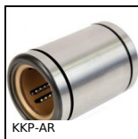
KKP-AR Linear bearing with inclined ball tracks,