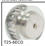
T25-6ECO T type timing pulley, Economy range - T2.5