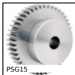
PSG15 Spur gear - precision range, Case hardened steel 20NCD2