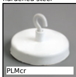
PLMcr Magnetic stud, With hook