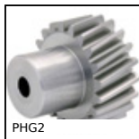
PHG2 Parallel axis helical gear - Precision range, 20NCD2 case hardened steel