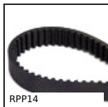
RPP14 RPP-type belt HTD compatible, RPP14