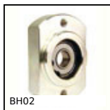
BH02 Flange with bearing, Bearing secured with circlips