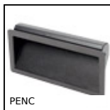
PENC Recessed handle, clip-in