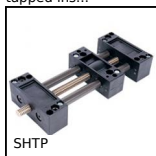
SHTP Drylin® Linear table, Economy range