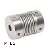
MFBS Bellows coupling, Stainless steel - with set screw