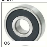
Q6 Deep groove ball bearing, Steel