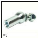
IBJ Ball and socket joint, Steel