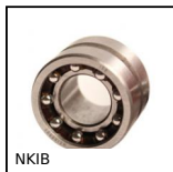
NK1B Combined bearing with inner ring, Axial load in both directions