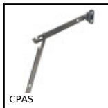
CPAS Stay with safety catch, Opens upward