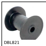
DBL821 Idler for slat top chain, Range 821