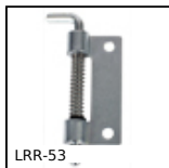
LRR-53 Latch, Spring return latch - steel