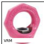
VRM Lifting ring, Female swivelling