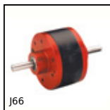
J66 Spur gear coaxial gearbox, from 0.90 to 2.80 Nm - In-line