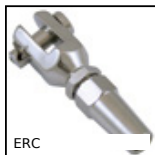
ERC Quick fitting cable terminals, Fork