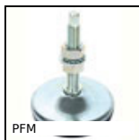
PFM Pressed steel foot, Flanged plate