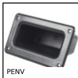
PENV Recessed handle, screw fixing