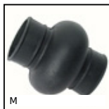
M Bellows cover, Standard