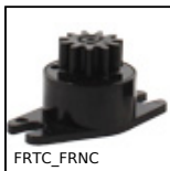
FRTC_FRNC Rotary dampener, 2 and 3Ncm