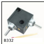
B332 Right angled gearbox, miniature