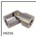
H02SS Universal joint - stainless steel, Needle bearings - single