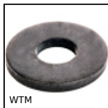
WTM Tightening washer - DIN 6340, Steel