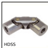
HDSS Universal joint - stainless steel, Needle bearings - double