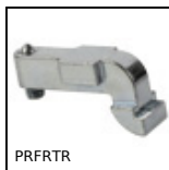
PRFRTR Connecting/joining, Cross connector