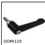
DOMI120 DOMILINE - Accessories, Clamping lever