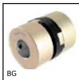
BG Oldham, With set screw