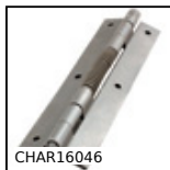
CHAR16046 Spring hinges, screwed