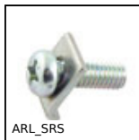
ARL_SRS Plastic flexible rack, Rack clamp