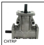
CHTRP Single and dual output gearboxes, Up to 87,3Nm