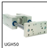
UGH50 H Type Guide units, For Ø50 actuators