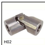
H02 Single needle roller universal joint, Heavy duty