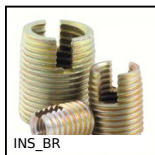
INS_BR Self tapping brass insert, Brass