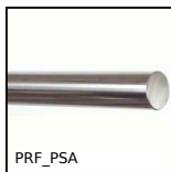
PRF_PSA Shaft support for aluminium profile, Linear guide shaft