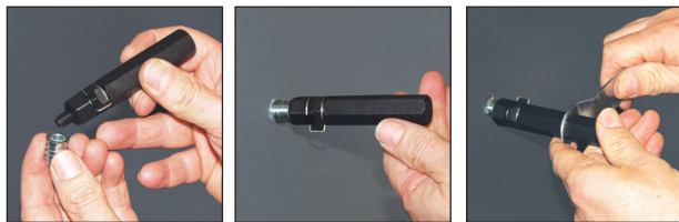
Example of a typical application