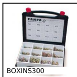
BOXINS300 Self tapping insert, Boxed set - For hard materials