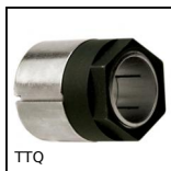
TTQ Hexagonal locking assembly, Low torque