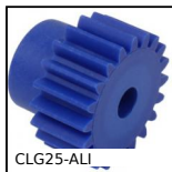
CLG25-ALI Spur gear, Moulded blue plastic (nylon)