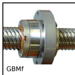
GBMf Ball screw, Flanged nut - Multiple starts