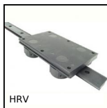
HRV V-rail guidance system, Rail with carriage