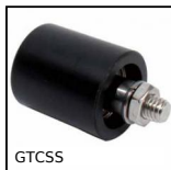
GTCSS Belt tension rollers, For use in hostile environments