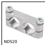
NDS20 Double cross clamp, Parallel