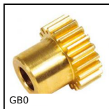
GB0 Spur gear, Brass CuZn40Pb3