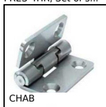
CHAB Hinge with stop, Hinge