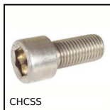
CHCSS Socket headed screw, Stainless steel - A2