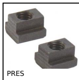
PRES Manual workbench press accessory for PRES-3HR end PRES-4HR, Set of s...