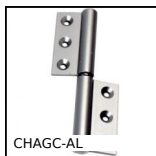
CHAGC-AL Screw-in garnet hinge, Screw-on