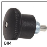
BIM Indexing plunger mini, miniature