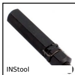
INStool Insertion tool for self tapping inserts, Insertion tool