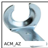
ACM_AZ Mounting bracket for bonnet fastener, Hook