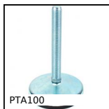
PTA100 Articulated levelling foot, pressed base