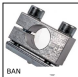
BAN Angular clamp, Standard