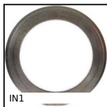
IN1 Internal gear, Steel 20NC2