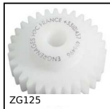
ZG125 Plastic spur gear, Machined plastic (delrin)