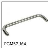
PGM52-M4 Push/Pull handle, Brass