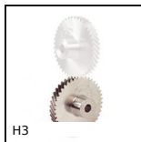
H3 Crossed helical gear crossed axis at 90°, Steel 20NCD2