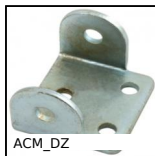
ACM_DZ Clip for bonnet fastener, Clip