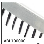
ABL100000 Antistatic brush, For sensitive surfaces