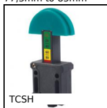
TCSH Automatic chain tensioner, With