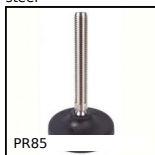
PR85 Articulated foot Ø83, Ø 83