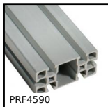
PRF4590 Standard aluminium profile, 45 x 90 mm