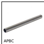
APBC Circular rod, Round rod