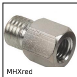
MHXred Reducing sleeve male/female, Hexagonal - stainless steel