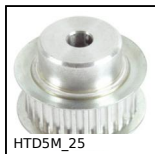
HTD5M_25 HTD Heavy duty timing pulley, HTD5 Steel