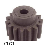
CLG1 Moulded plastic spur gear, Moulded plastic (nylon)