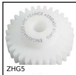
ZHGS Plastic spur gear, Machined plastic (delrin)