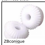
ZBconique Machined plastic bevel gear, 1:1