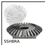
SSHBRA Stainless steel bevel gear, 1,5:1 2:1 3:1