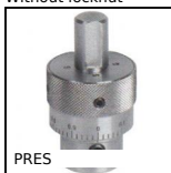
PRES Manual workbench press accessory for PRES-3HR end PRES-4HR, Micromet...