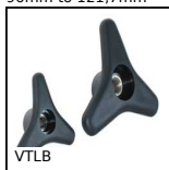
VTLB Three-lobed knob, Thermoplastic / Brass or stainless steel