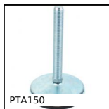
PTA150 Articulated levelling foot, pressed base