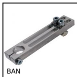
BAN Angular clamp, Adjustable