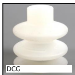
DCG Suction cup, 2.5 bellows, silicon