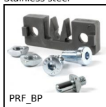
PRF_BP Doorstop for aluminium profile,