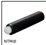
Set screw delrin tip, Delrin-point