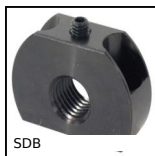
Locking bolt support bracket, Mounting holes at 90° to locating bolt