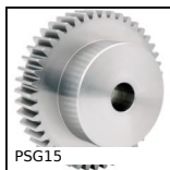
Spur gear - precision range, Case hardened steel 20NCD2