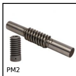
Worm and wheel set, Hardened steel