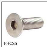
Countersunk screw, Stainless steel A2 - DIN 7991