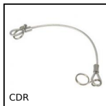
Retaining cable for ball pin, Retaining cable