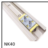
Drylin®N miniature guiding system, Width 40 mm