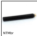
Set screw brass tip, Brass-point