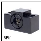
Bearing housing for miniature ballscrew, Bearing housing