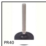
Articulated foot Ø40, Ø 40