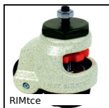
Locking castor, with central hole