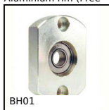
Single housed bearing, Bearing fitted with adhesive