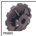
Idle sprocket for slat top chain, Range 880