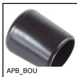
Protective cap, Safety cap