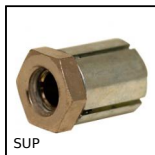
Self-centering clamping hub steel, Without locknut