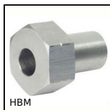
Adjustment bushing for half-rail guide, Adjustment bushing