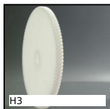
Crossed helical gear crossed axis at 90°, Machined plastic (delrin)