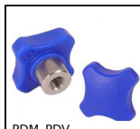
Detectable plastic palm grip, blue thermoplastic