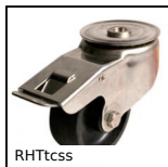
High Temperature Castor, up to 200kg