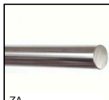
Shaft for linear guides, Hardened ground steel