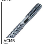
Dual-thread screw wood/metal, Stainless steel