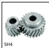
Parallel axis helical gear, Steel 20NCD2