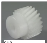
Parallel axis helical gear, Machined plastic (delrin)