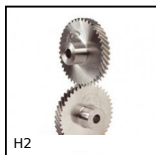
Crossed helical gear crossed axis at 90°, Steel 20NCD2