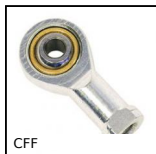
Female rod ends DIN ISO12240-4, Steel / bronze