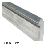
Half-rail guide, Rail