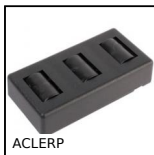
ACLERP Roller block for aluminium profile, Without guide rail