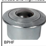
BPHF Ball transfer unit push fit, Heavy