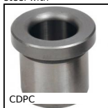
CDPC Flanged drill bushing, Steel