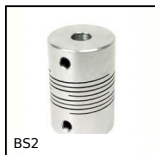
BS2 Panamech, Multi-Beam, Aluminium - with set screw