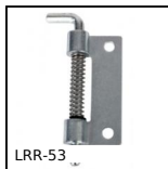
LRR-53 Spring loaded latch, Spring return latch - steel